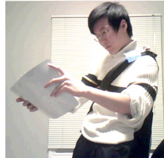
Figure 4. A Cobra player in action.

Wiimote circuitry and pico projector. When not in use, the board fits nicely in the bag with the computer, since it is thin, light, and has dimensions similar to those of the computer. When the user wants to play a game, he or she takes the board out of the bag, and presses both pressure points simultaneously to start the game selector. The user can then scroll through the list of games by bending, and start a game by pressing the primary pressure point.