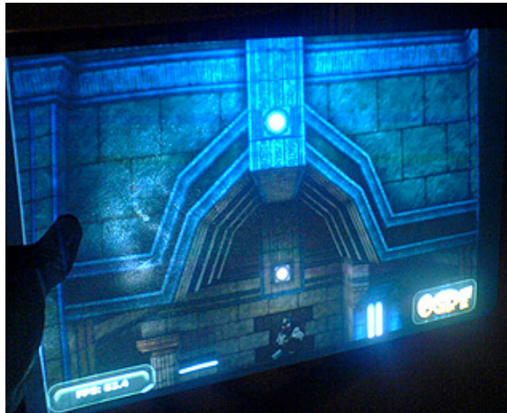
Figure 5. Sample game projected on Cobra board.

projection. This makes Cobra private and non-invasive, unlike other projection-based interfaces, such as Wear Ur World / Sixth Sense [11]. When the user lowers the board or moves it out of the way, it leaves the projector's light cone, and the entire projected image disappears, thus saving battery power. When the player wants to stop playing, he or she simply puts the board back into the bag.