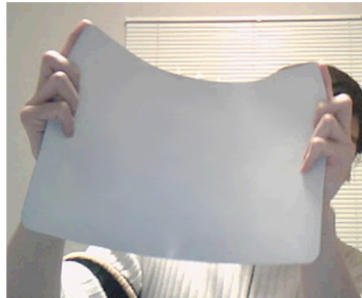
Figure 2. The front side of the Cobra board.