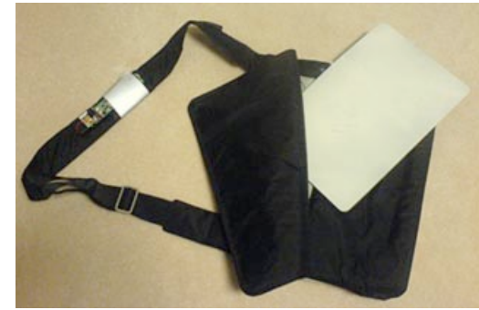
Figure 1. The prototype consists of a modified notebook carrying bag, a pico projector, and an input/display board.

The Cobra prototype consists of a flexible display board on which a game is projected using a pico projector. The game is run on a netbook worn in a carrying bag (Fig 1). The decision to make Cobra a computer peripheral allows users to play games that leverage the power of laptops, while at the same time giving them the level of freedom provided by handhelds. Thus, it makes computer gaming more mobile, and makes mobile gaming more powerful. As Figure 1 shows, a regular